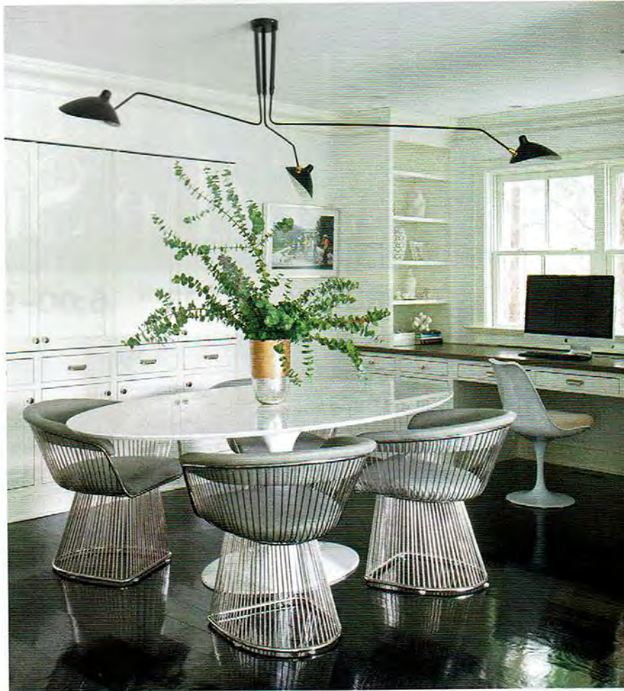
In the kitchen, Tom Dixon pendants hang over a breakfast bar topped with gray quartz; a Serge Mouille chandelier floats above the dining table (top right).